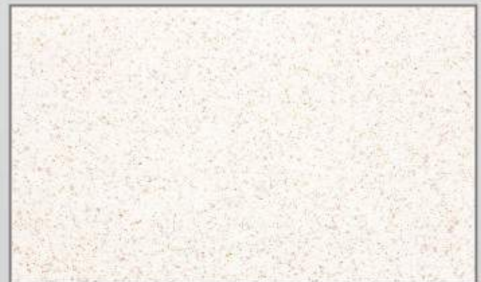
KG - 702