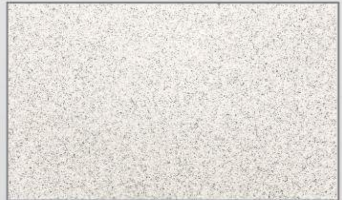
KGT - 701