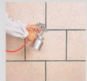
6. Kabaat Professional Top Coat