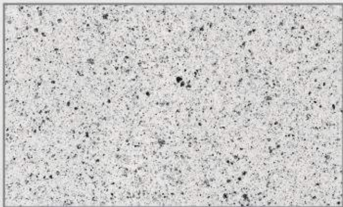
KG - 301