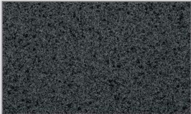
KG - 321