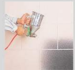
3. First Grani Koat