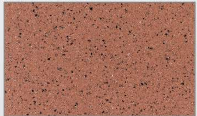
KG - 14535