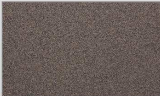
KGT - 721