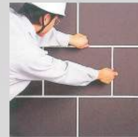
2. Fixing Masking Tape