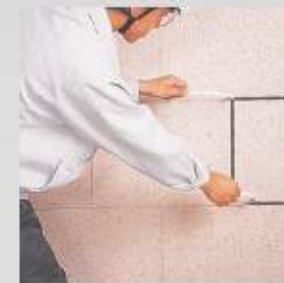
5. Remove Masking Tape