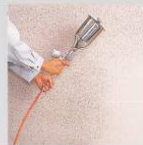
4. Second Grani Koat