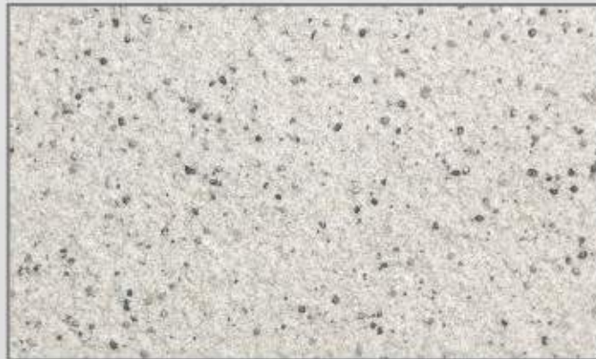
KGT - 608