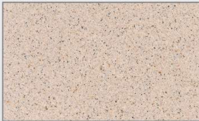
KG - 303